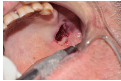
Figure 3: dental socket just after tooth extraction. Note the absence of buccal attached gingiva.

Irrigation of the sinus with saline through the OAC was carried out. Lavage fluid was clear and did not contain inflammatory exudates. A rectangular gingival flap of total thickness ( Figure 4 ) was raised from the top of the ridge, rotated and buccally sutured to gain attached gingiva ( Figure 5 ).