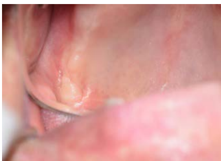
Figure 9: Seven weeks after the surgery (photo taken by a mirror)

One week later, mucosal examination showed a conservation of the buccal sulcus depth ( Figure 9a ) and a 3mm gain of adherent buccal gingiva ( Figure 9b ). The impression of the patient's removable denture was taken the same day. He was able to wear it two weeks later. The removable denture was retentive ( Figure 10a, Figure 10b ).