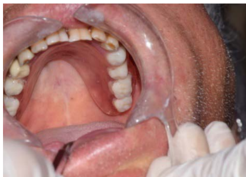
Figure 10: a-b: Retentive removable partial denture in mouth (Photo taken by a mirror).

a: Note the conservation of the buccal sulcus depth b: note the gain of 3mm of adherent buccal gingiva.