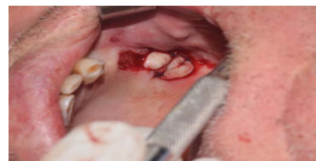
Figure 6: closure of the dental socket by the PRF membrane.

A PRF membrane was furnished in the bony defect ( Figure 6 ) and sutured superficially as well on the socket for complete and hermetic closure ( Figure 7 ). Amoxicillin and clavulanic acid (Augmentin®) (1 g twice a day), steroidal anti- inflammatory (Nasonex ®) as nasal drops, acetaminophen-codeine (Klipal ®) (600mg twice a day) for pain control and warm saline intraoral mouth rinses with 0.12% chlorhexidine, were prescribed. The patient was instructed to avoid vigorous sports and activities that may produce pressure changes. No post-operative complications were observed and complete wound healing was noted after one month. A gingival nodule was noted at the base of the gingival flap due to its rotation ( Figure 8 ). This nodule was deepithelialized.