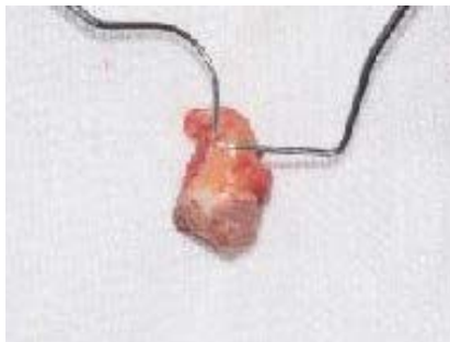
Figure 2: The left maxillary third molar after its extraction.

The tooth was urgently extracted at the same day and the dental socket was softly inspected using a surgical alveolar curette. Examination showed an oroantral communication that was confirmed by the Valsalva Test: An air flow was noticed in addition to air bubbles getting out of the alveolar socket. The diameter of the communication was about 10mm. It was clinically determined using a surgical alveolar curette and the mirror test. The root depth in the maxillary sinus was about 6mm. It was initially visualized on the panoramic x-ray and then confirmed after the extraction of the tooth ( Figure 2 ). The depth of OAC was about 1 mm (distance between the highest spot on the crest and the sinus floor).