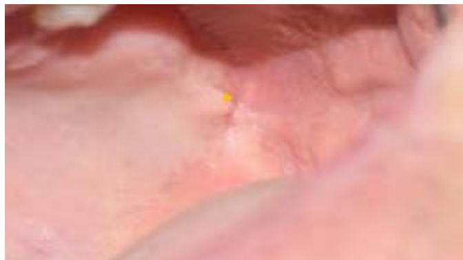
Figure 8: clinical picture showing full closure of the communication one month after the surgery. Note the gingival nodule at the base of the gingival flap