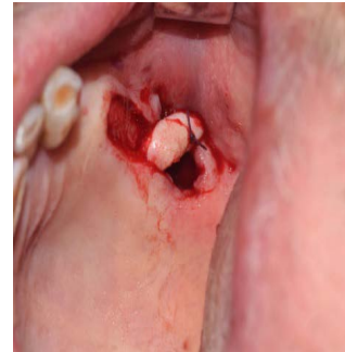
Figure 5: gingival flap was elevated, rotated and buccally sutured.

A PRF membrane was furnished in the bony defect ( Figure 6 ) and sutured superficially as well on the socket for complete and hermetic closure ( Figure 7 ). Amoxicillin and clavulanic acid (Augmentin®) (1 g twice a day), steroidal anti- inflammatory (Nasonex ®) as nasal drops, acetaminophen-codeine (Klipal ®) (600mg twice a day) for pain control and warm saline intraoral mouth rinses with 0.12% chlorhexidine, were prescribed. The patient was instructed to avoid vigorous sports and activities that may produce pressure changes. No post-operative complications were observed and complete wound healing was noted after one month. A gingival nodule was noted at the base of the gingival flap due to its rotation ( Figure 8 ). This nodule was deepithelialized.