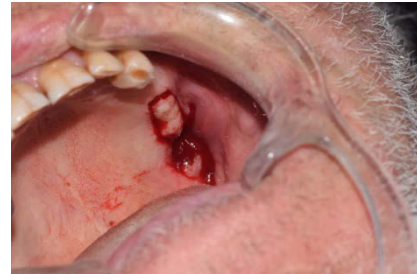
Figure 4: two horizontal palatal and buccal incisions joined together on the anterior side by a vestibulo- palatal incision, giving a rectangle pattern.