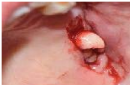
Figure 7: suture of the second PRF, superficially.