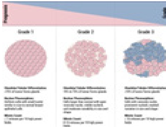
Figure 1: Graphic description of Nottingham grading of invasive carcinoma breast (5).