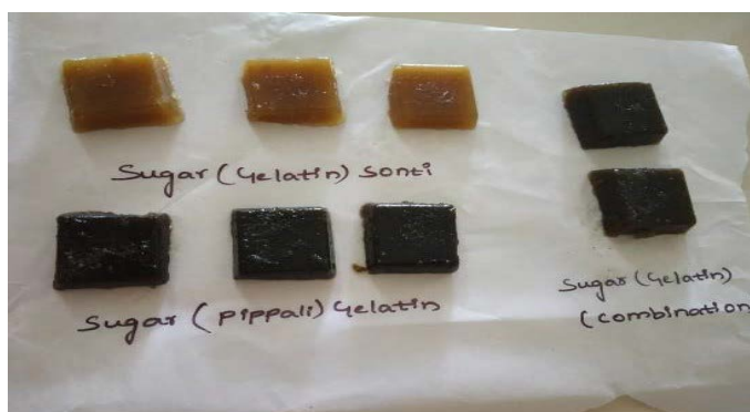
Figure 5: Herbal Soft Candy