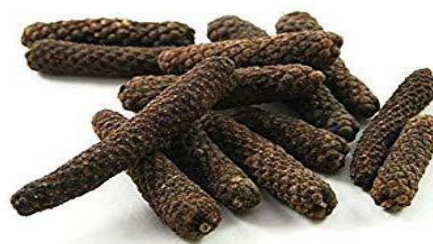
Figure 3: Longum.