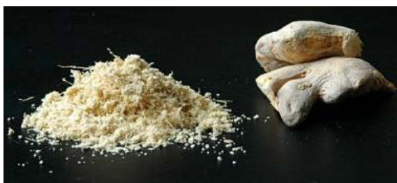
Figure1: Dried Ginger