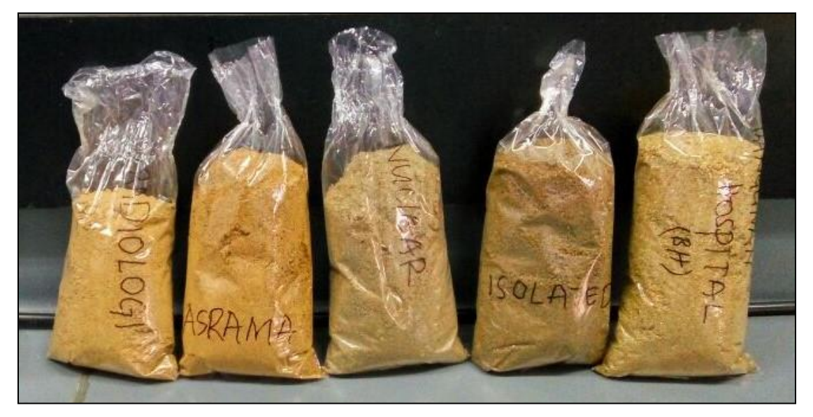
Fig. 1 Soil samples after drying process for <sup>222</sup>Rn measurements collected from six different locations

This research work was conducted to determine the <sup>222</sup>Rn concentrations among different locations of soil samples in Health Campus, Universiti Sains Malaysia, Kubang Kerian, Kelantan, Malaysia. In this study, soil samples were collected from six different locations and categorized into three general areas which are red, isolated and public areas. The samples were dried to reduce and remove the moisture into the soil as shown in Fig 1. Radon Sentinel 1030 monitor manufactured by Sun Nuclear Corporation, United State of America (USA) was used to measure the <sup>222</sup>Rn concentrations emanated from the selected soils in a close perspex box as shown in Fig. 2.