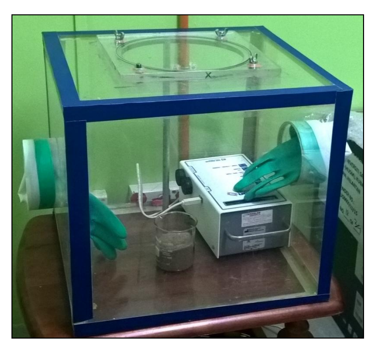
Fig. 2 Radon Sentinel 1030 monitor was used to determine <sup>222</sup>Rn concentrations level emanated from collected soil samples